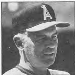
Mauch Pgs. 16-17