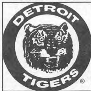
Opponents Pgs. 99-116