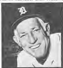
SPARKY ANDERSON Manager