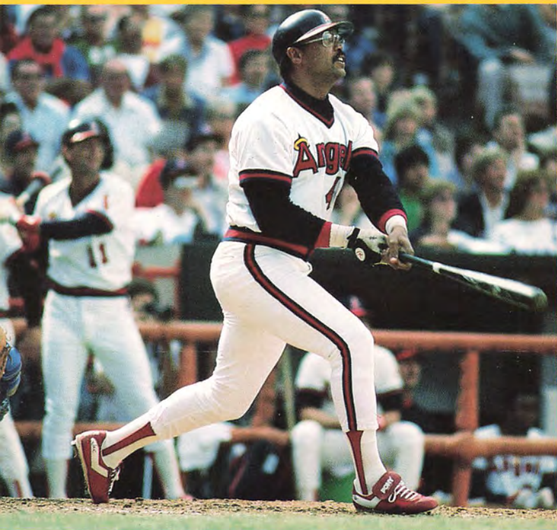
Reggie Jackson Joined "500" Home Run Club September 17, 1984