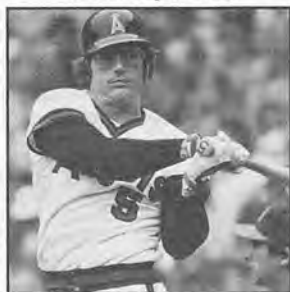
Players Pgs. 20-79