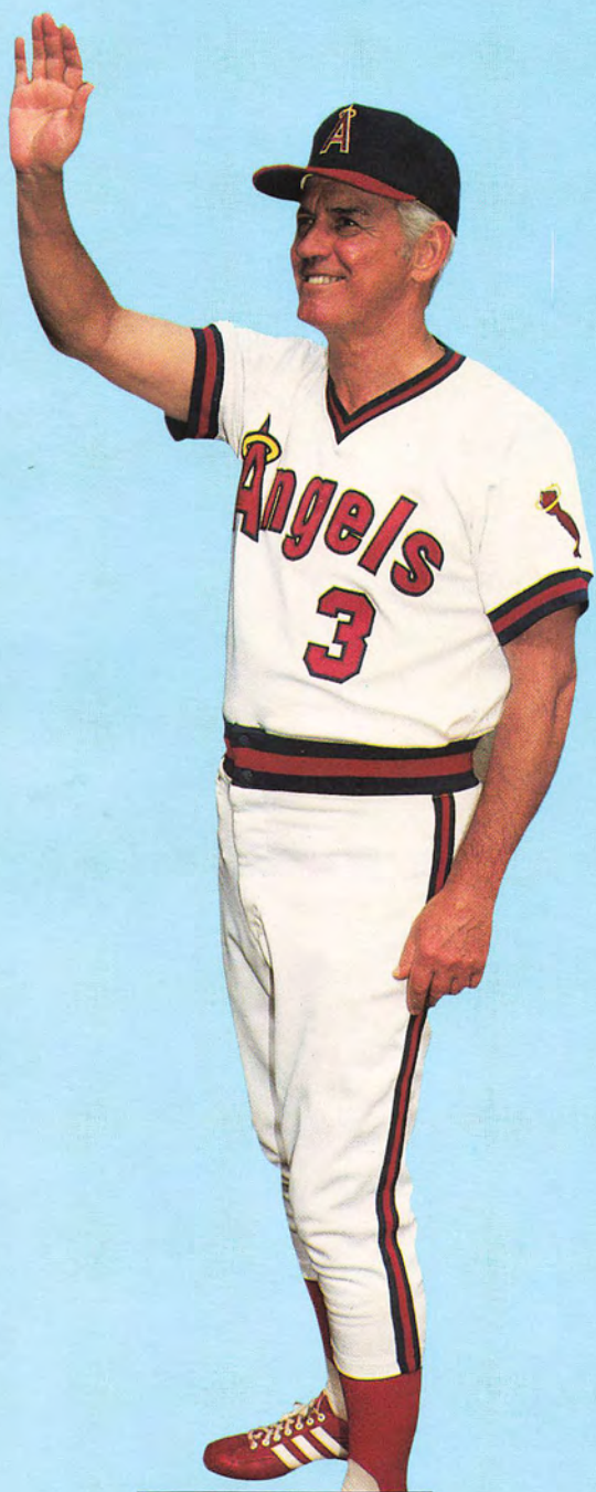
Gene Mauch Back at the Helm