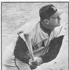
History Pgs. 3-11