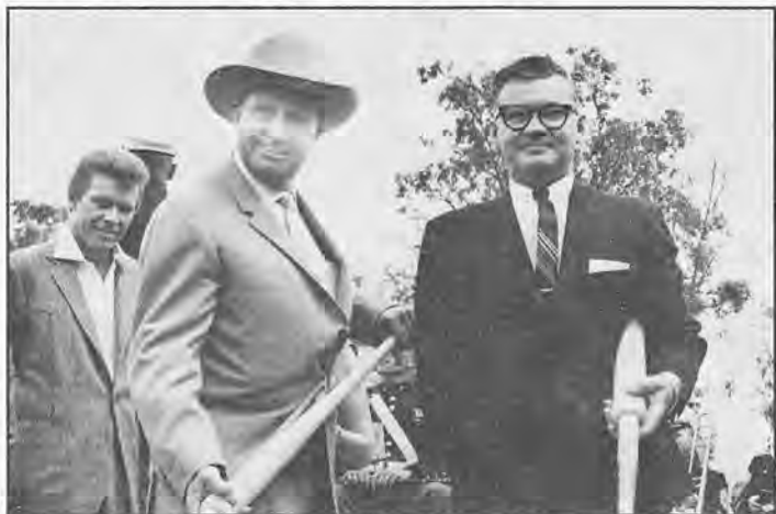
GENE AUTRY & ODR A CHANDLER

August 31, 1964 — Ground was broken to commence construction of Anaheim Stadium. Angels owner Gene Autry, Del Webb and then Anaheim Mayor Odra Chandler spaded the first shovels of soil in a clearing surrounded by an orange grove and a corn field.