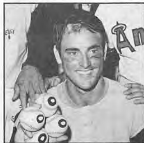
Records Pgs. 145-167