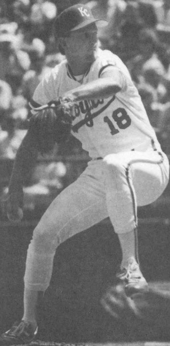
Bret Saberhagen 1985 & 1989 American League Cy Young Award Winner