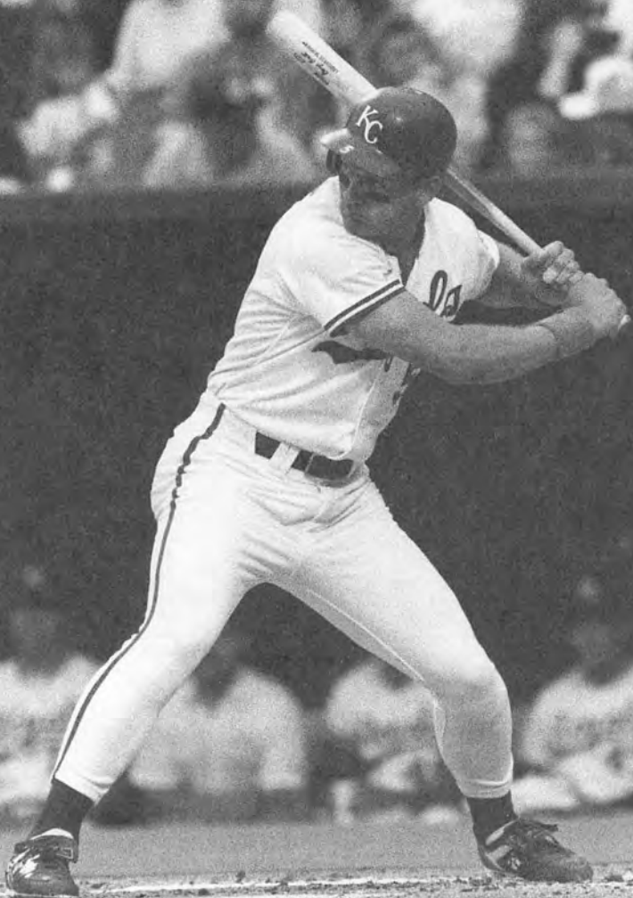
George Brett Royals Player of the Year