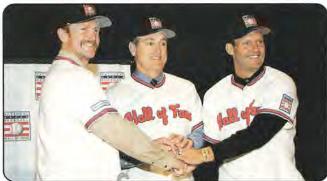
The Hall of Fame class of 1999, Robin Yount, Nolan Ryan and George Brett, pose at a January 6, 1999 press conference in New York