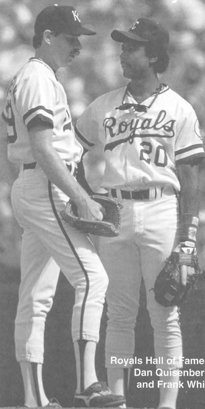
Royals Hall of Famers Dan Quisenberry and Frank White