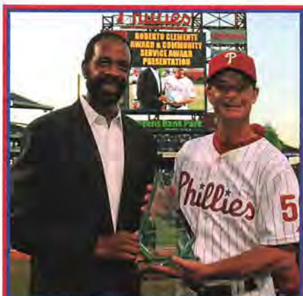
Jamie Moyer was the Phillies Community Service Award winner for 2007. He received his award from former Phillies outfielder Garry Maddox prior to a game last September.

The Phillies are also committed to providing the underprivileged youth of Philadelphia the opportunity to play organized baseball through the Rookie and RBI League programs. Rookie and RBI Leagues are designed not only to encourage inner-city children (from ages 6-18) to play baseball, but also to teach them the value of teamwork and sportsmanship. Combined, the programs involve more than 7,000 boys and girls yearly, making it one of the largest RBI and Rookie League programs in the country. In addition, the Phillies also initiated and host three local amateur baseball tournaments. The Carpenter Cup is designed to give exposure to the top tri-state area high school baseball and softball players while the Liberty Bell Classic is an annual Division I college tournament. The Giles Cup, started in 2001, is a tournament for Division II colleges.