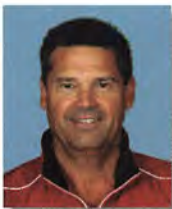
Sonny Bowers Professional Coverage