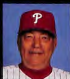
Johnny Podres 1932-2008