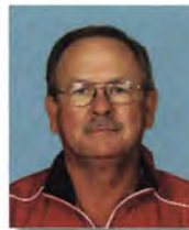
Del Unser Professional Coverage