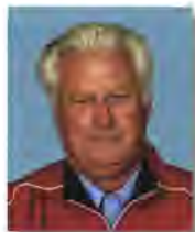
DALLAS GREEN Senior Advisor to the General Manager

In 52 years of professional baseball, Dallas Green has held almost every position possible, including player, manager, general manager, scout and team president. On April 23, 1998, Dallas returned to the Phillies in a new position, as a senior advisor to the general manager.