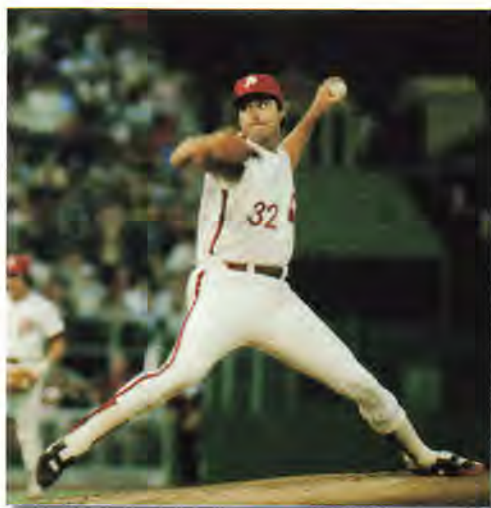
Steve Carlton was the first pitcher to win four Cy Young Awards

Note: See Yearly Pitching Leaders in this section for more information.