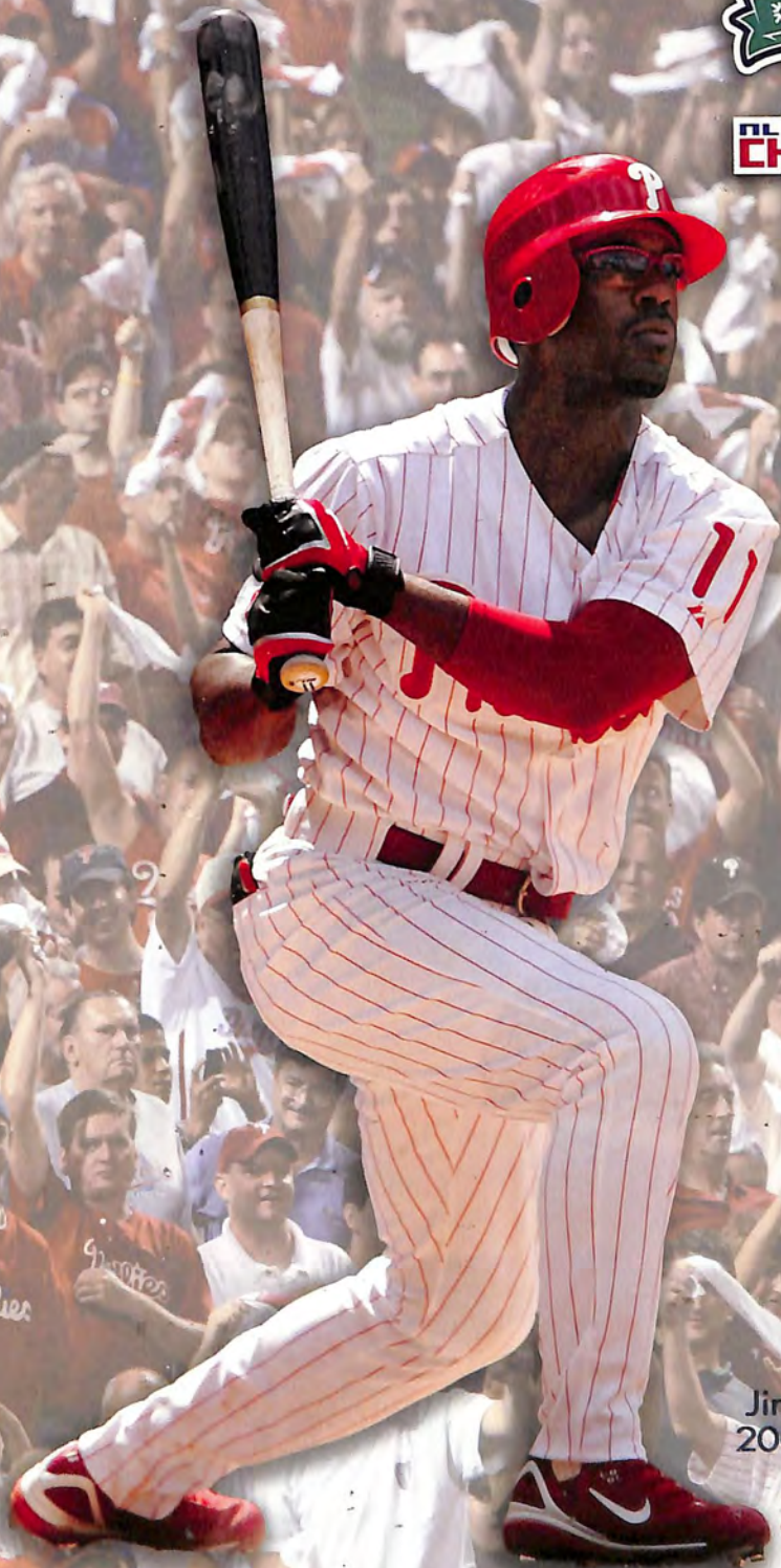
Jimmy Rollins 2007 NL MVP