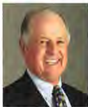
PAT GILLICK Senior Vice President & General Manager

The 2007 season made it 4-for-4 for Pat Gillick. The Phillies' National League East Division championship made the club the fourth team out of four constructed by Gillick to reach the playoffs.