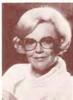
Joan Kroc Director