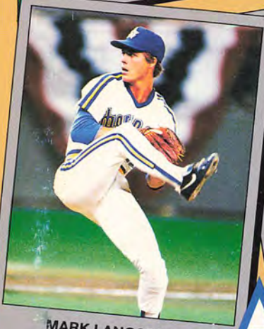
MARK LANGSTON Pitcher