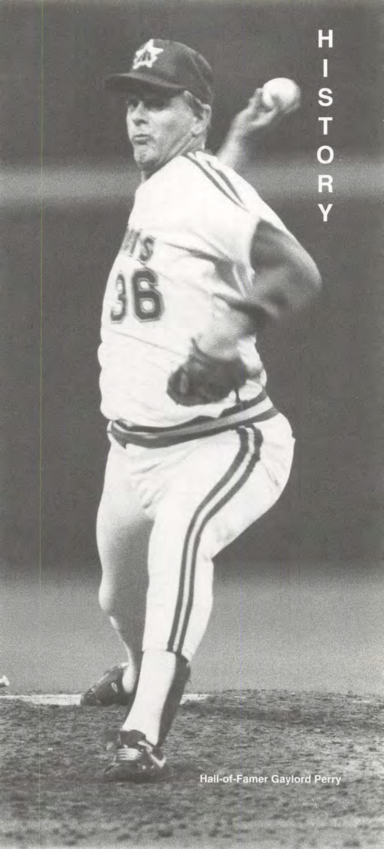
Hall-of-Famer Gaylord Perry