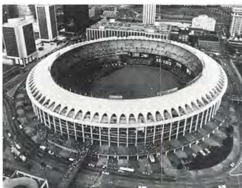
Busch Stadium Measurements — Left Field Corner, 330; Left-Center, 383; Center, 414; Right-Center, 383; Right Corner, 330; Height of Outfield Walls, 10 feet, 6 inches.