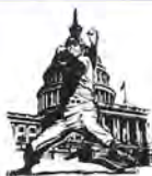
WASHINGTON SENATORS 1961-71

(19 batters, 16 runs, eight hits, eight walks, no errors, one wild pitch).