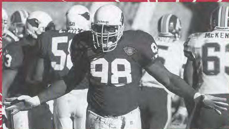
Eric Swann emerged as one of the NFL's finest defensive tackles.

A guy named Webster defines "stride" as "a stage of progress." In a fella named Buddy Ryan's first season as head coach and general manager, the Arizona Cardinals made noticeable strides and progress on and off the field, measured by an 8-8 campaign that translated into the franchise's first non-losing season and highest victory total since 1984, flirtation with post-season play, a sturdy, vastly improved defense, and an energized community that doubled the season-ticket base, sold out Sun Devil Stadium three times, and set a franchise single-season home attendance record (497,330).