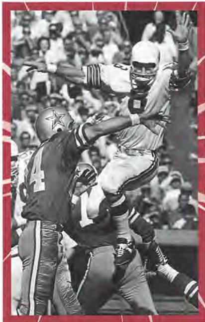
Cardinal Vice President and Hall of Famer Larry Wilson still holds the team pass interception records.