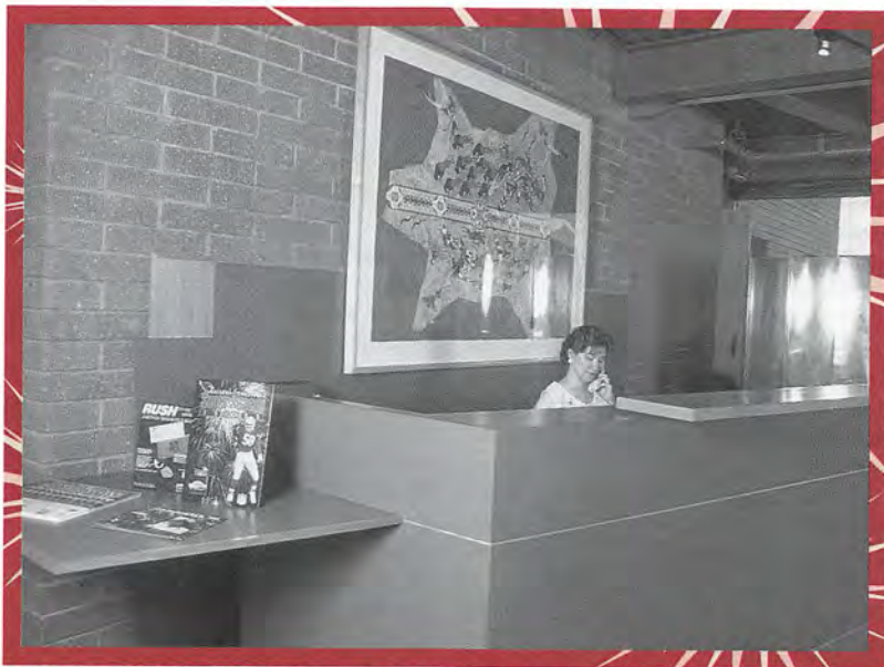
The reception lobby at the Cardinals' south Tempe training facility