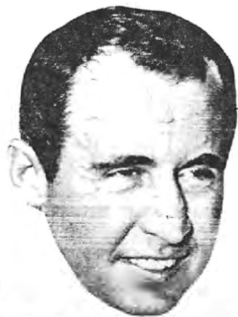
BILL ATKINS , Halfback. All Southeastern Conference Selection, Auburn 1956-57 . . . All-American 1957 . . . Auburn Record-holder most points scored in a single season . . . Participated East-West Shrine games and College All Star games . . . Played two years, San Francisco 49'ers, defensive back . . . Signed by Bills as defensive back and kicker.