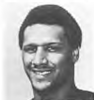
ROSS BROWNER DE 24 6-3 262 Notre Dame 2