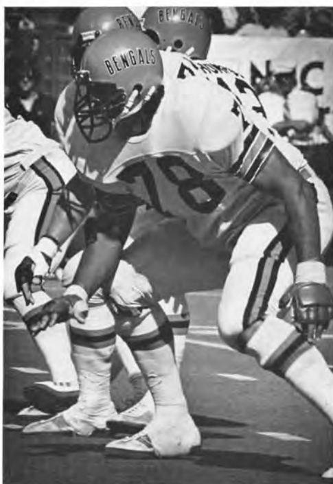
MAMMOTH ANTHONY MUNOZ GOES TO WORK ...Bengal's young offensive tackle was one of the top NFL rookies in 1980.