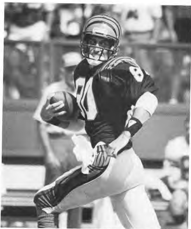
CRIS COLLINSWORTH IN 1985 ... 65 receptions, 1125 yards, five touchdowns.