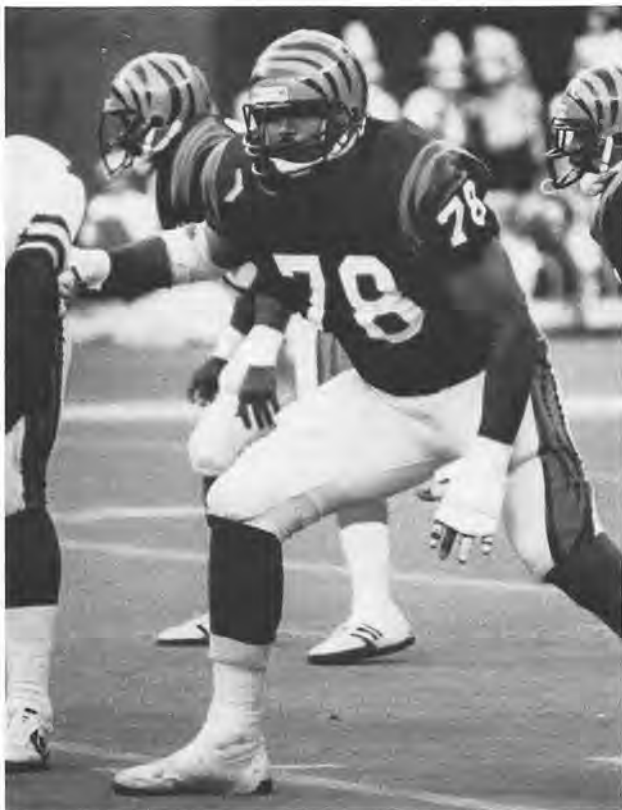
ALL-PRO OFFENSIVE TACKLE ANTHONY MUNOZ ... five consecutive Pro Bowl appearances.

*NBC-TV Doubleheader Week, **CBS-TV Doubleheader Week.