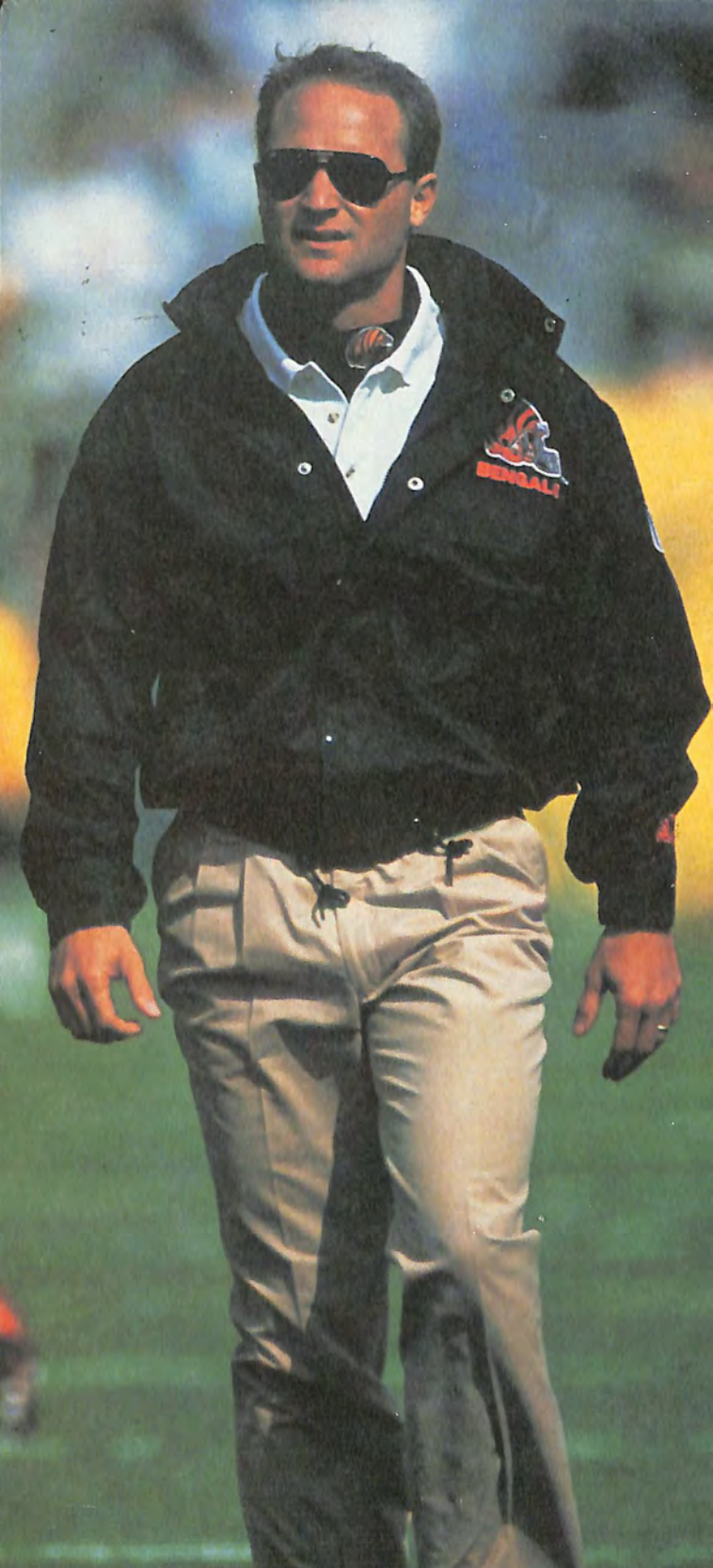
CINCINNATI COACH DAVE SHULA