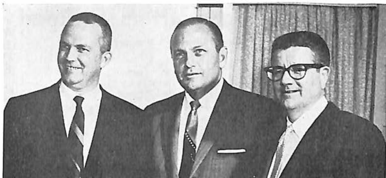
Bedford S. Wynne • Texas E. Schramm • Clint W. Murchison, Jr.