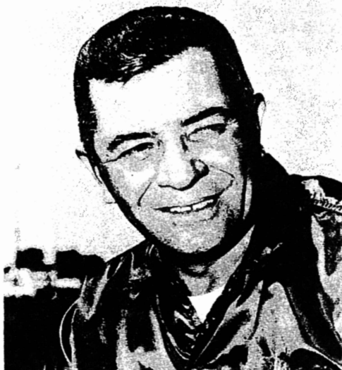
VINCE LOMBARDI — Head Coach

The story of football in Green Bay, Wis., has long been one of the NFL's best known legends. Some of the greatest chapters in that city's gridiron history, however, are still being written by a transplanted Easterner.