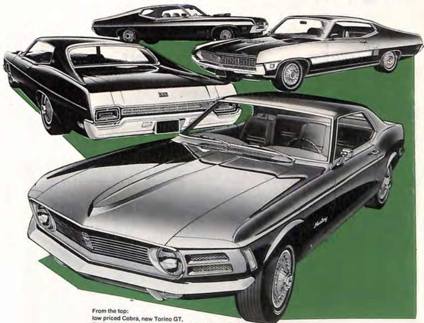
From the top: low priced Cobra, new Torino GT, Big Ford XL (rear view), and Mustang Mach 1. All hot for '70.

Only in your Ford Dealer's Performance Corner—such a wide choice of track-tested performance cars.