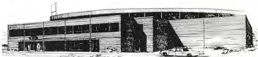
Architect's conception of the remodeled Packer administration building.

The administration building on Lombardi Avenue also will be expanded and remodeled. The improvements will include new and additional administrative and coaches' offices, a new and larger dressing room, more meeting rooms, a new players' lounge, new public relations and ticket offices and a new lobby—plus racquetball courts and a jacuzzi. ( An architect's sketch of the remodeled building appears below. ) Work is expected to begin in late summer or early fall and be completed by the start of the 1983 season.