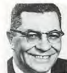
Vince Lombardi 1959-1967 Coaching Record: 141-39-4 Winning Pct.: .777