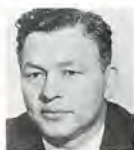
Earl "Curly" Lambeau 1921-1949 Coaching Record: 202-109-24 Winning Pct.: .639