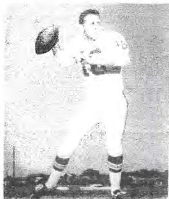
LEN DAWSON Quarterback, Purdue