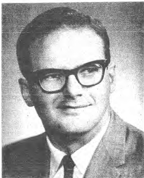
LAMAR HUNT President, Dallas Texans