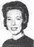
PAT CROSS Publicity