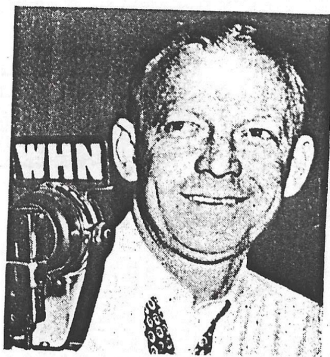
"Red" Barber, nationally famed sports broadcaster, vividly describes the New York Football Giants games over the airways for Old Gold.