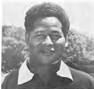
EMLLEN TUNNELL Assistant Coach—11th Year

One of the all-time great safetymen in the history of professional football and also the first member of his race ever to become a regular fulltime coach in the National Football League, Em Tunnell is presently in his 11th season as an assistant on the staff of the New York Giants. In 1963-64, Tunnell combined his scouting chores with special coaching assignments in training camp and then, in 1965, he became a regular member of the staff. It followed that Em would be put in charge of the secondary; few men in the game have a wider knowledge or a keener insight into the intricacies of defensive backfield play than the former Giant great. Affable, easy-going Em Tunnell was a legendary safetymen with the Giants for 11 brilliant seasons (1948-58) and then spent three additional seasons with Green Bay (1959-61) before becoming a scout. The word legend is easily applicable to Tunnell. In his day, he was truly one of the ironmen of the sport. With the Giants he set a consecutive game record of 126 and he later ran that string to 158 with Green Bay. Em still holds two all-time NFL records—most career interceptions (79) and most punt returns (258).