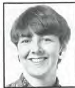
Pat Ference Accounting