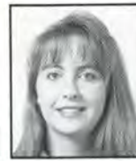
Stacey Hammond Tickets