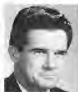
Coach Dick Nolan

1255 Post Street, Suite 300, San Francisco, Calif. 94109