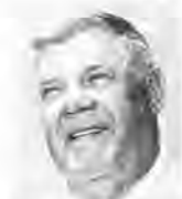
Coach Weeb Ewbank

SEPTEMBER 8, AT TAMPA, FLA. (Pre-Season Game)—8:00 P.M. DECEMBER 9, AT PHILADELPHIA—1:00 P.M.