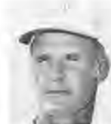
Coach Tom Landry