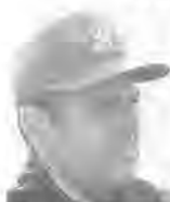
Coach George Allen

SEPTEMBER 30, AT PHILADELPHIA—1:00 P.M. DECEMBER 16, AT WASHINGTON—1:00 P.M.