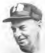
Coach Paul E. Brown