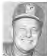
Coach Norm Van Brocklin

NOVEMBER 11, AT PHILADELPHIA — 1:00 P.M.