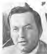
Coach C. Fairbanks