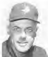
Coach Bud Grant

OCTOBER 21, AT BLOOMINGTON, MINN.—1:00 P.M.