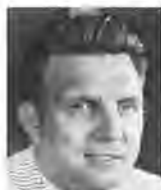
Coach Lou Saban

69 West Mohawk Street, Buffalo, N. Y. 14202