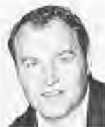
Coach Chuck Noll

AUGUST 16, AT PHILADELPHIA (Pre-Season Game)—8:00 P.M.