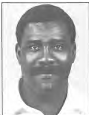
JOE GREENE Defensive Line Coach