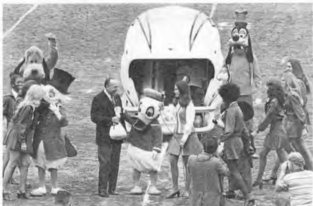
Donald Duck and Disneyland Friends Frolic for 'United Way'