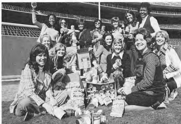
Charger Wives Collect Thanksgiving Food for Senior Citizens