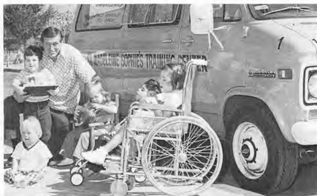
Johnny Unitas Brings Cheer to Mentally Retarded Children