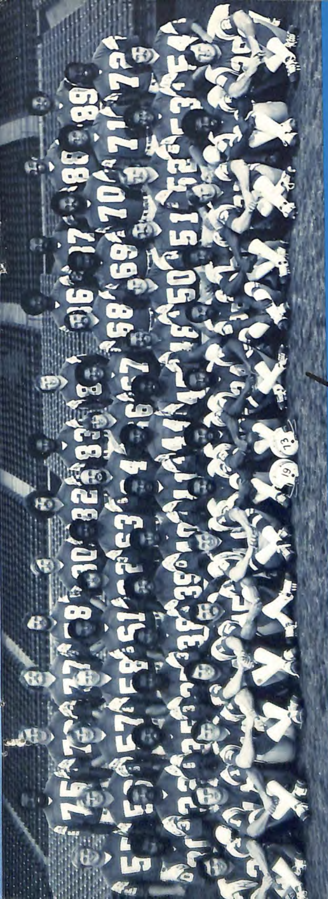
1973 SAN DIEGO CHARGERS