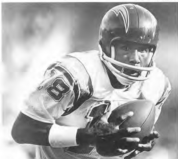
San Diego Chargers

Wide Receiver Charlie Joiner is the Chargers' all-time leading pass catcher.