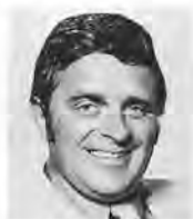
Harland Svare 1971-73 Washington State