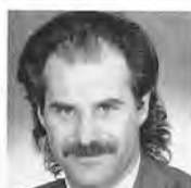
THOM VOLLENWEIDER Photographer