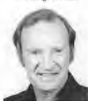
Don Coryell 1978-86 Washington