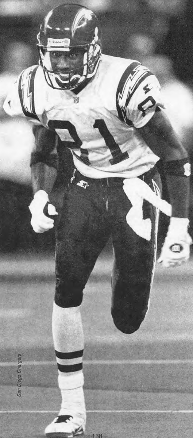
San Diego Chargers