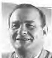
Sid Gillman 1960-69, 71 Ohio State