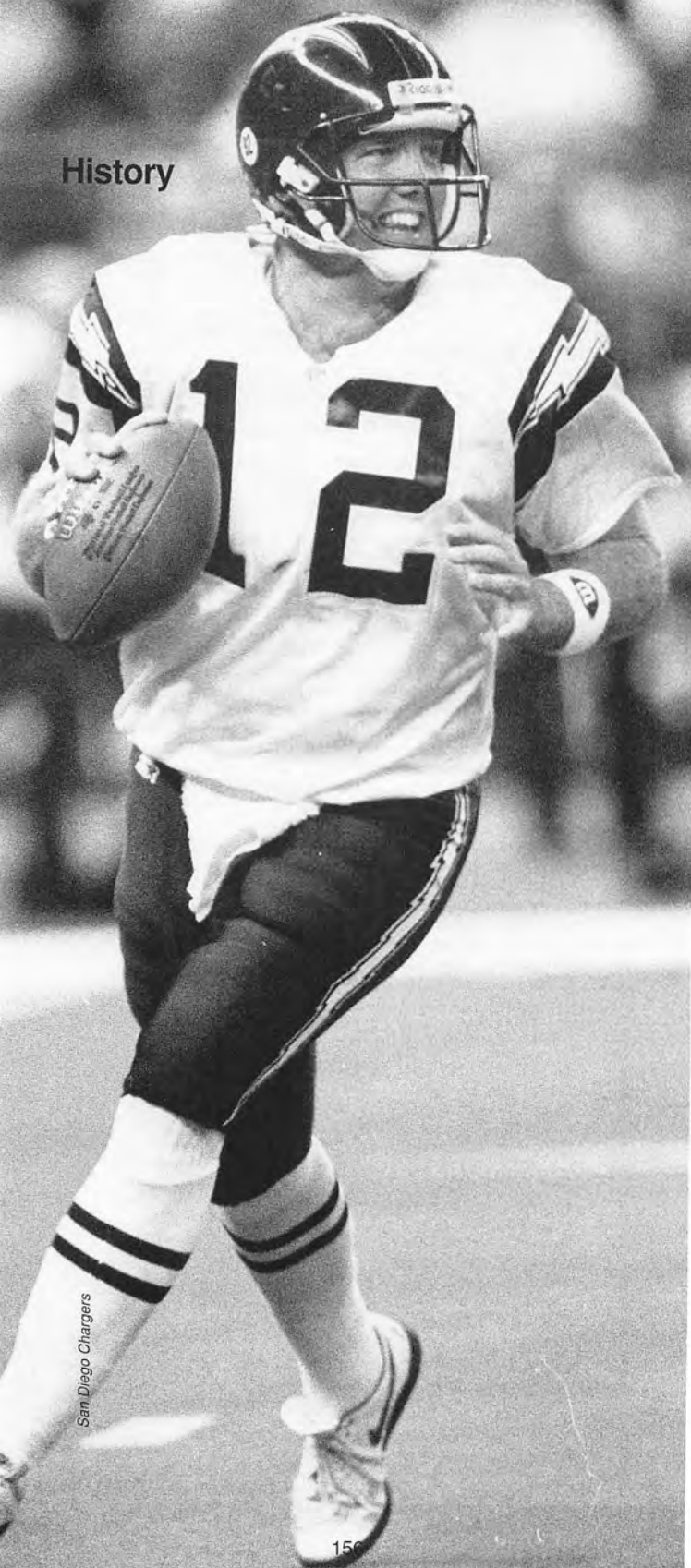
San Diego Chargers