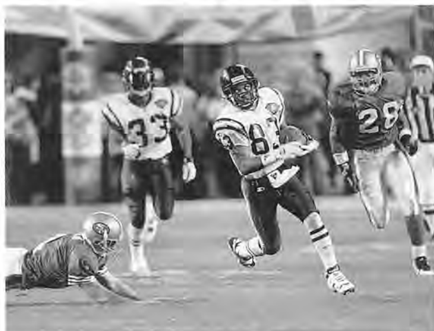
San Diego Chargers