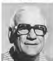
Tommy Prothro 1974-78 Duke