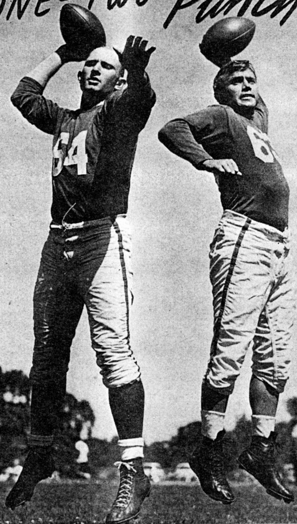
Y. A. TITLE (left) and FRANK ALBERT give the San Francisco Forty Niners one of the greatest one-two quarterback punches in the National Football League.