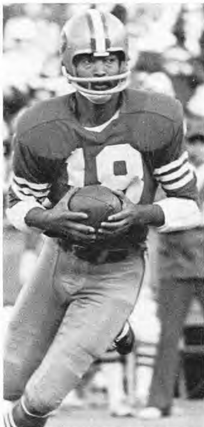
GENE WASHINGTON , above, generally recognized as one of the premier wide receivers in the NFL, is in his seventh season as a San Francisco 49er with a career total of 262 receptions for 4,834 yards (an average of 18.5 yds. per catch) and 39 TDs.