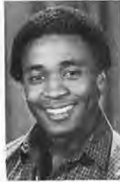
Rodney Knox Publications