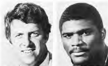
Bill Parcells Lawrence Taylor