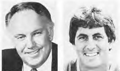
John Robinson Vince Ferragamo