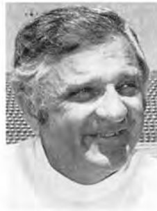
Mickey Dukich Cinematographer