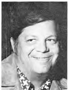
Jerry Mickelsen Ticket Office