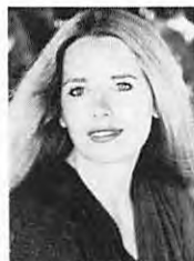
Mardy Medders Entertainment