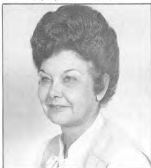
Jean Perry Ticket Office