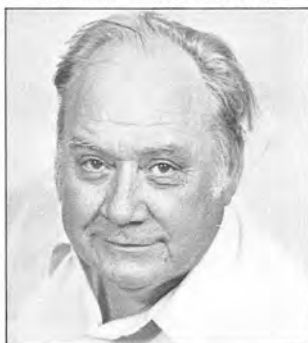
Lou Witt Still Photographer