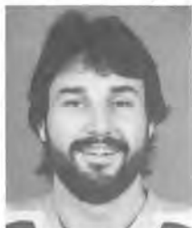
PAUL COFFEY (Edmonton)