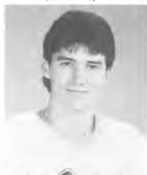
MARIO LEMIEUX (Pittsburgh)