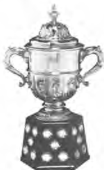
LADY BING TROPHY (Gentlemanly Player)