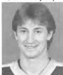
WAYNE GRETSKY (Edmonton)

HART (MVP) ROSS (SCORING) SMYTHE (MVP in Playoffs)