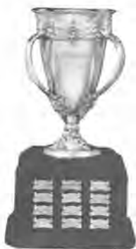
CALDER TROPHY (Outstanding Rookie)