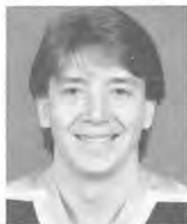
JARI KURRI (Edmonton)