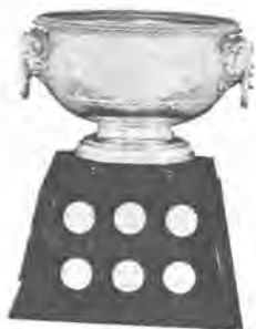
ART ROSS TROPHY (Highest Point Total)