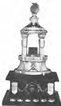
VEZINA TROPHY (Goaltenders)