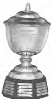
NORRIS TROPHY (Outstanding Defenseman)