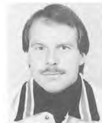
MIKE BOSSY (Philadelphia)